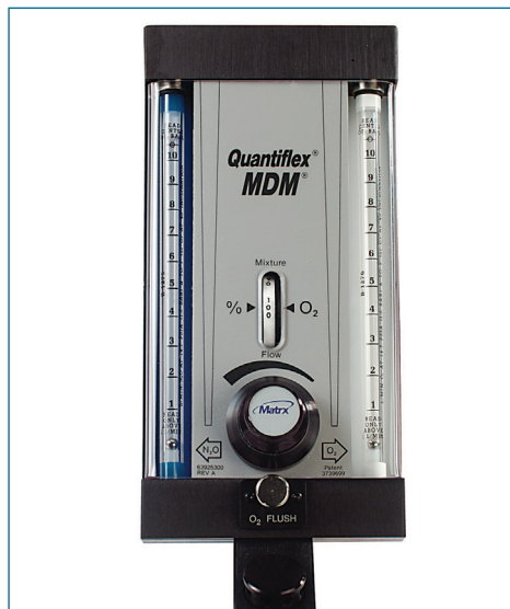
Figure 3. MDM machine 'head'

Infection control and care of the breathing system is a vital component in the use of inhalation sedation. The system and connections should be included in a equipment pre-use checklist.