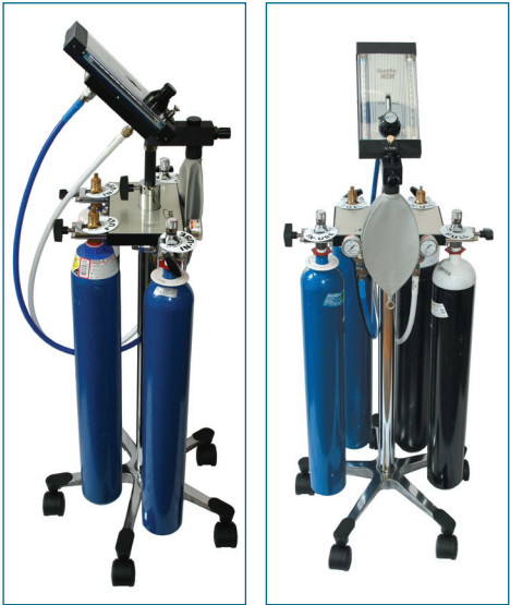
Figure 1. IS machine with cylinders