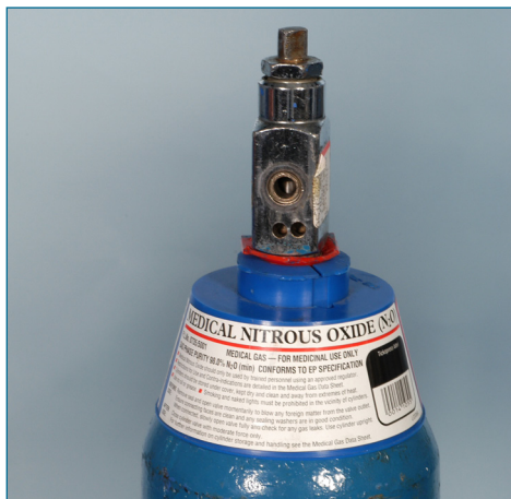
Figure 2. Nitrous oxide pin index system

gauge starts to fall only when the liquid phase is exhausted and pressure in the gas phase is reducing.